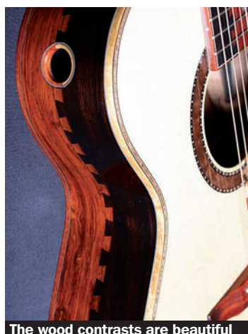
The wood contrasts are beautiful

The Acoustic Music Co 01273 671841 www.theacousticmusicco.co.uk